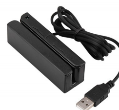
7100.PGT120.TEST.17 Magnetic Card Stripe Reader