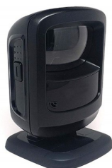
7100.PGT120.TEST.15 Barcode Scanner