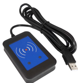
7100.PGT120.XK.V3 RFID Reader

We request that a RFID card be sent in to make sure the data output is correct and that the data terminal does not need to be formatted for your use.