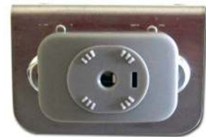
CP3000 Parking Station

CYCLOPS™ assure compliance with personnel grounding requirements and protect ESD safe workstations by sensing when an operator is within the protected work area. An operator who approaches the workstation without connecting their wrist strap causes the monitor to alarm. The alarm continues until compliance is achieved, preventing isolated operators from damaging ESD sensitive devices.