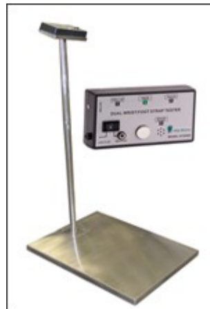
Model GTS600 K: Tester and Foot Plate