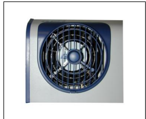
Removable fan guard with safety switch and point cleaner.