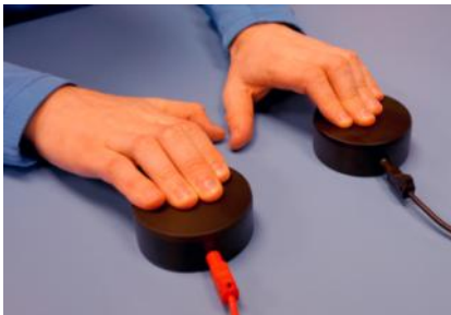
"Press and Test" Travel Probes

Meets requirements of ANSI/ESD S4.1, S7.1, S2.1 and STM12.1 and STM97.1