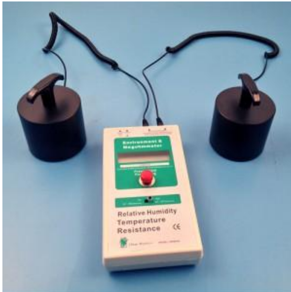
Figure 3 – Resistance Point To Point (RTT)

This measurement is made using two 5 lb electrodes. The electrodes are placed 10” apart on the work surface in various locations. Figure 3 is an example of a point-to-point test.