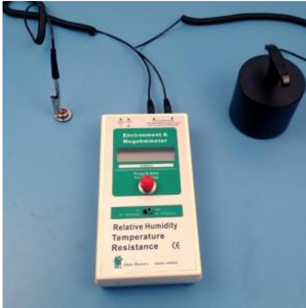
Figure 2 – Resistance Point To Groundable Point (RTGP)

This measurement is similar to the RTG measurement except that the negative lead is attached to the grounding point (snap) of the work surface. The testing is performed using 100 volts when the expected resistance is greater than 1.0 \times 10^6 ohms.