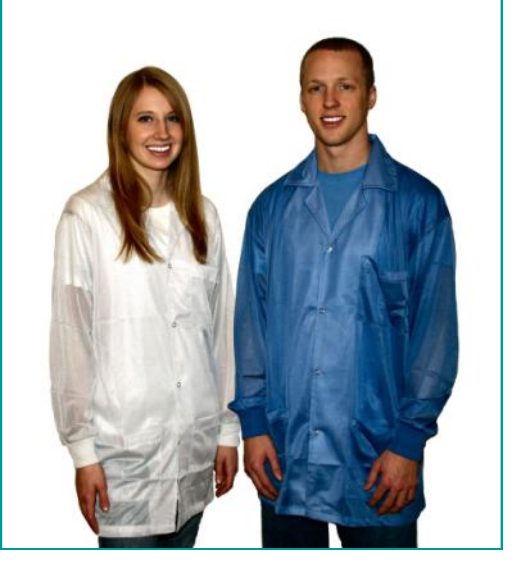
Model: JKC 8801– JKC8810 Collared ESD Jackets Small - 6XL