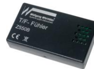
7100.3000.TF * Temperature and humidity sensor