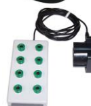
7110.E8 8-socket grounding box