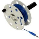
7100.2000.TR50 Cable reel, 50 m