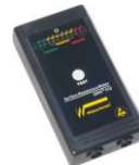
7100.SRM110 .A * Surface Resistance Meter SRM ® 110