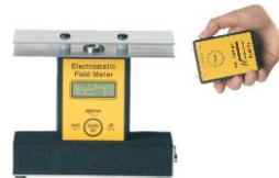
7100.EFM51.CPS * Electrostatic Field Meter EFM ® 51 with charged plate set