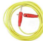
7100.WT5000.ML Connecting cable 3m

* These instruments are supplied with a calibration certificate