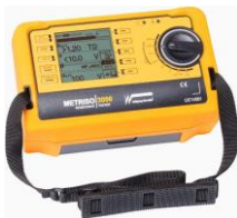
7100.3000.G * High resistance meter with connecting cables